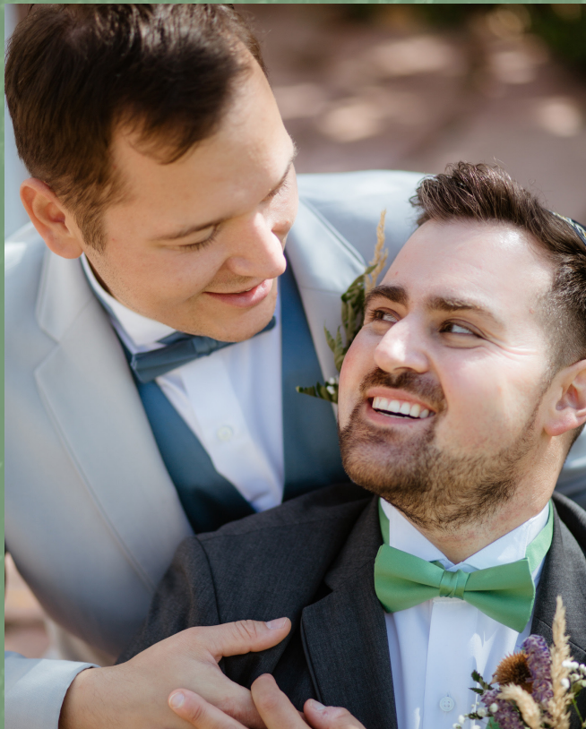
Our wedding day