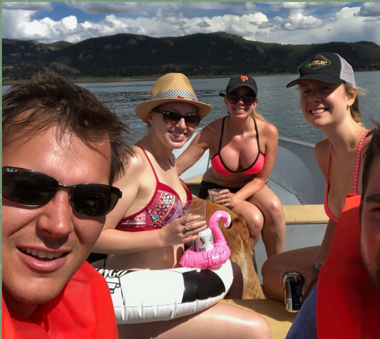
Boating day with friends

We have a very large, eclectic friend group in Colorado, many of which have very young children or who are on a similar timeline as us. With our friends, we love to entertain in our home, go to concerts and music festivals, host group camping trips, ski and snowboard across the continent, host overly competitive board game sessions, and go out to restaurants.