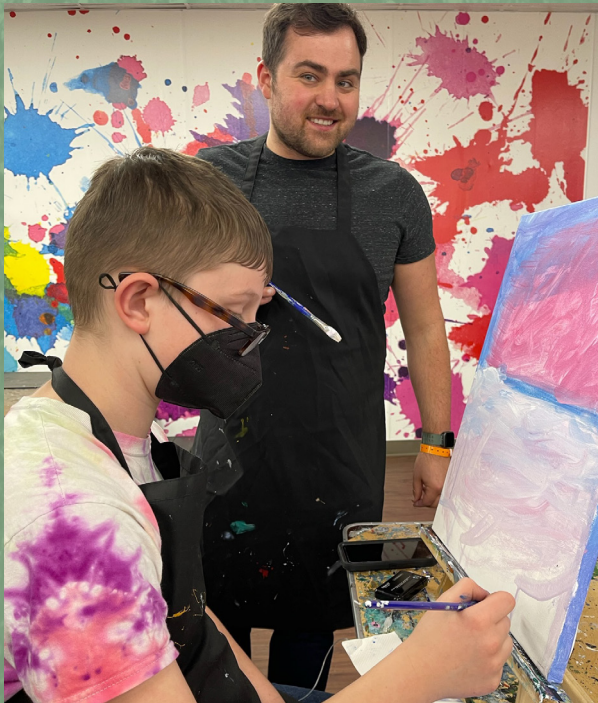
Painting with our friend's kid

As children of divorced parents, we are deeply committed to being excellent parents and providing a stable, and accepting, household. As parents, we will build a nurturing, caring, and supportive environment with natural consequences, never using physical discipline. We are excited to help our child problem solve, understand rules and expectations, and facilitate open, healthy, two-way communication where all feelings are valid. Our child's physical safety and emotional wellbeing will always be our top priority. As a family, our parenting values are self-compassion, self-determination, humility, mutual respect, honesty, and flexibility. We will prioritize the importance of relationships with people and experiences over things and items. Our goal is to raise successful, self-sufficient children who are able to care for themselves while loving and building deep connections with people, animals, and the environment.