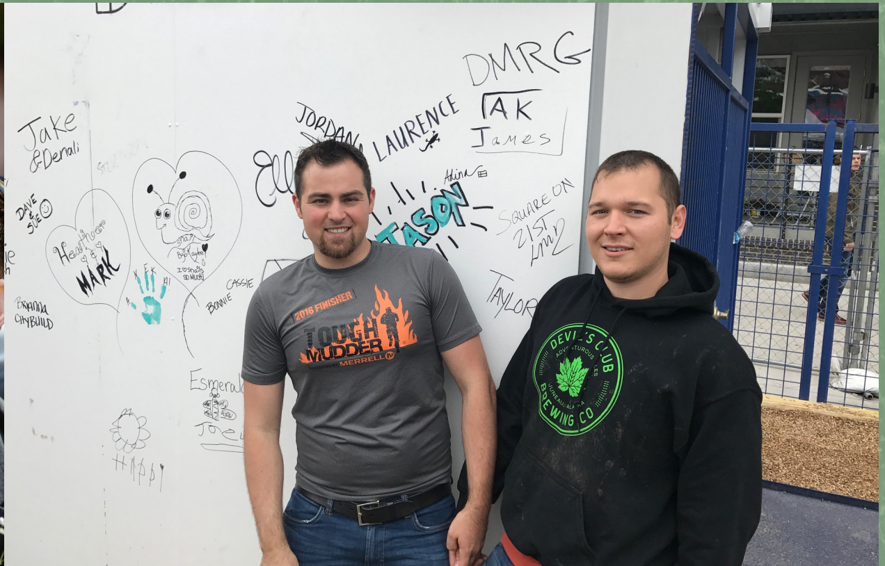
At a pop up park in Denver