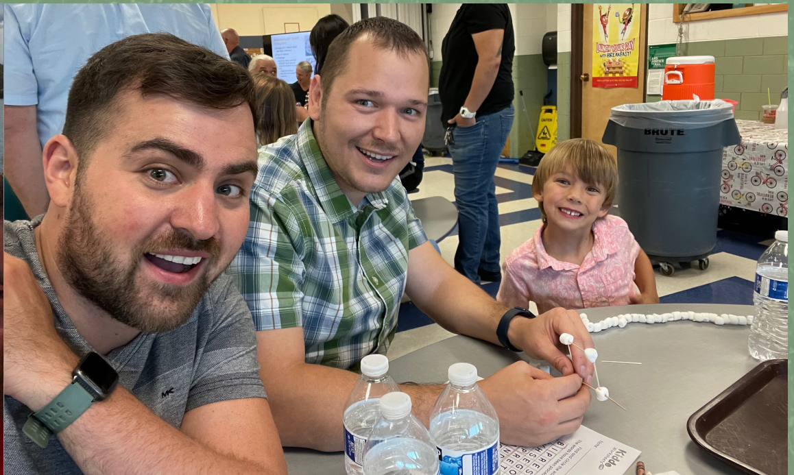
Enjoying Father's Day with our friend's child