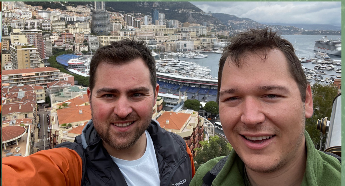
Us in Monaco on a family vacation